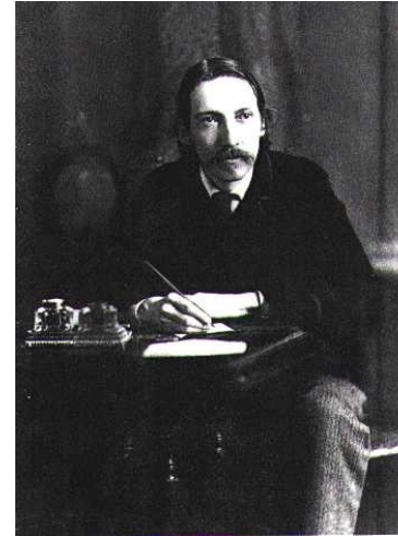
Robert Louis Stevenson

About a week has passed, and I am now finishing this statement under the influence of the last of the old powders. This, then, is the last time, short of a miracle, that Henry Jekyll can think his own thoughts or see his own face (now how sadly altered!) in the glass. Nor must I delay too long to bring my writing to an end; for if my narrative has hitherto escaped destruction, it has been by a combination of great prudence and great good luck. Should the throes of change take me in the act of writing it, Hyde will tear it in pieces; but if some time shall have elapsed after I have laid it by, his wonderful selfishness and circumscription to the moment will probably save it once again from the action of his ape-like spite. And indeed the doom that is closing on us both has already changed and crushed him. Half an hour from now, when I shall again and forever reindue that hated personality, I know how I shall sit shuddering and weeping in my chair, or continue, with the most strained and fearstruck ecstasy of listening, to pace up and down this room (my last earthly refuge) and give ear to every sound of menace. Will Hyde die upon the scaffold? or will he find courage to release himself at the last moment? God knows; I am careless; this is my true hour of death, and what is to follow concerns another than myself. Here then, as I lay down the pen and proceed to seal up my confession, I bring the life of that unhappy Henry Jekyll to an end.